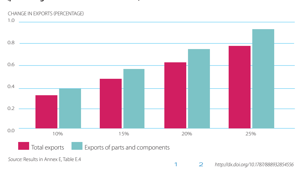
Figure 5.2 Impact of aid for trade increases on parts and components exports (percentage of additional aid for trade)

Econometric analysis for this chapter confirms that aid for trade has a positive and significant correlation with increased exports of parts and components from developing countries. In fact, the results are somewhat stronger. A 10 percent increase in aid for trade to all developing countries is associated with a 0.4 percent increase in parts and components exports as compared to a 0.3 percent increase in all exports.<sup>20</sup> Moreover, as with the relation of aid for trade to all non-mineral exports, aid for trade to an importing developing country is associated with positive increases in trade. Here, too, the combined effects a 10 percent increase in aid for trade to both exporters and importers is associated with a 0.5 percent increase in parts and components trade as compared to a 0.4 percent increase for all non-mineral exports. Possible increases in aid for trade could have a substantial impact on increasing value chain trade; Figure 5.2 shows the direct effects on exports associated with differing levels of increases, leaving aside the influence of aid for trade on importing countries.