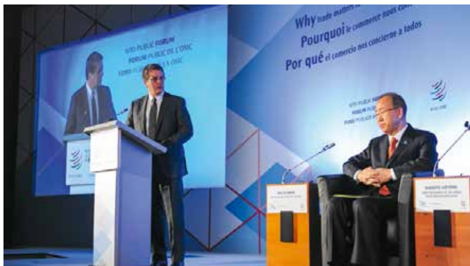
✓ DG Azevêdo and UN Secretary General Ban Ki-moon at the opening session of the 2014 Public Forum.