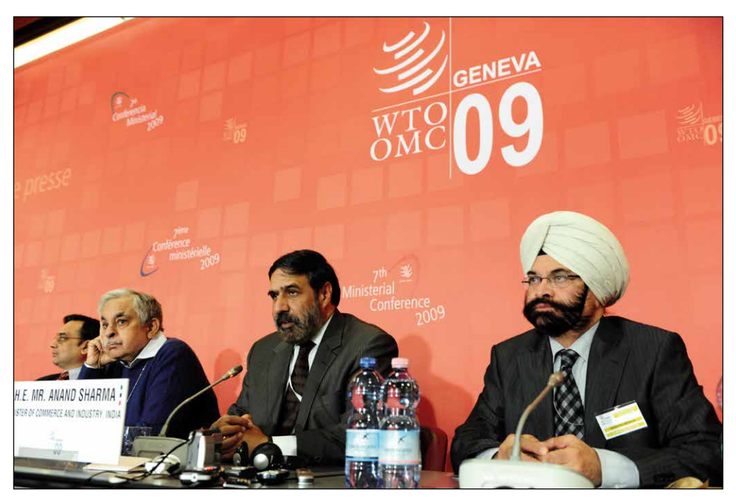
Anand Sharma ( centre ), Commerce and Industry Minister of India, holds a press conference at the Seventh WTO Ministerial Conference, accompanied by Ambassador Ujal Bhatia ( right ), on 2 December 2009.