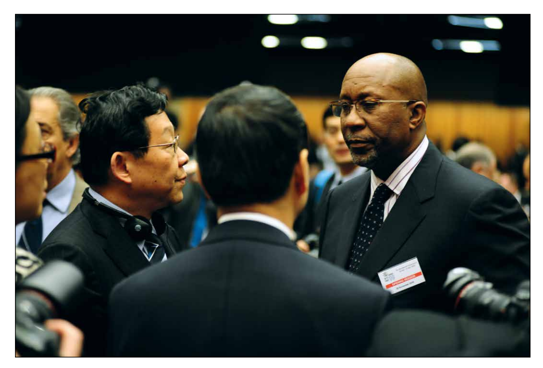
US Trade Representative Ron Kirk ( right ) and Chen Deming ( left ), China's Minister of Commerce, at the Seventh WTO Ministerial Conference on 30 November 2009.