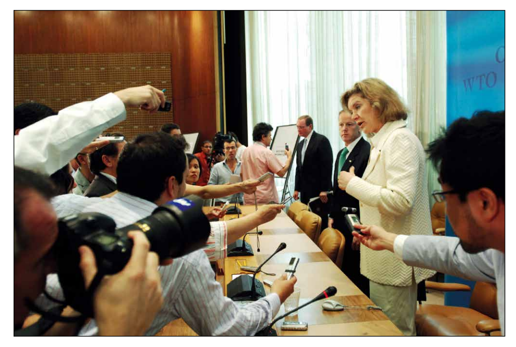
US Trade Representative Susan C. Schwab speaks at a press conference on 22 July 2008, at the start of the mini-ministerial.