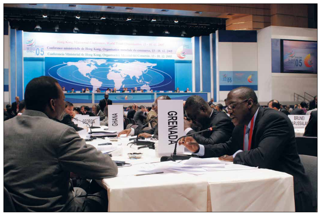
The Sixth WTO Ministerial Conference is held in Hong Kong, China, 13 to 18 December 2005.