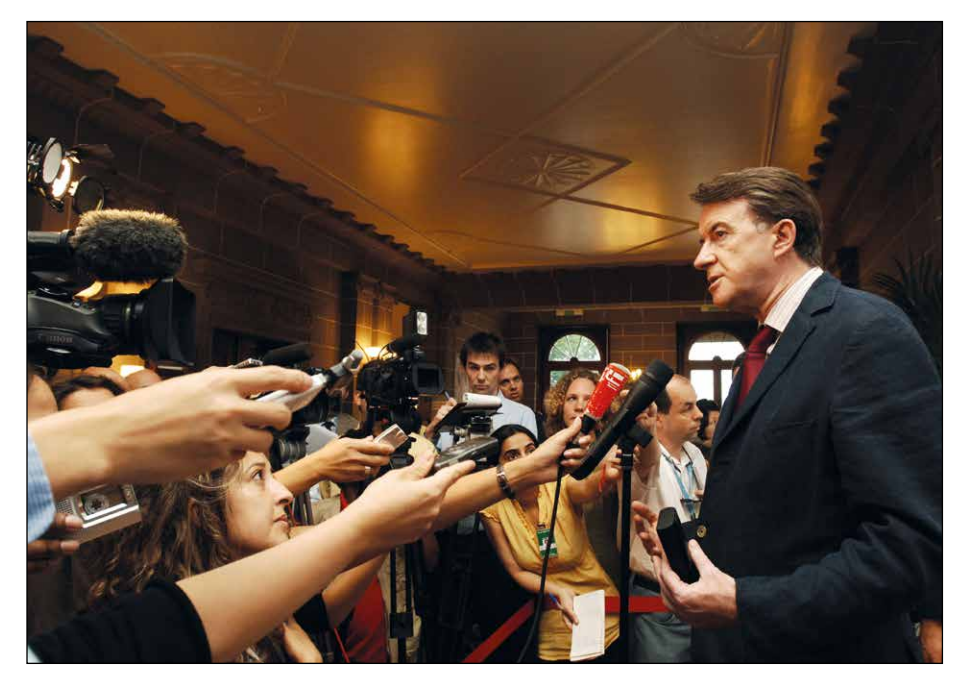
European Commissioner for Trade Peter Mandelson speaks with journalists on 26 July 2008, following a meeting of the Trade Negotiations Committee.