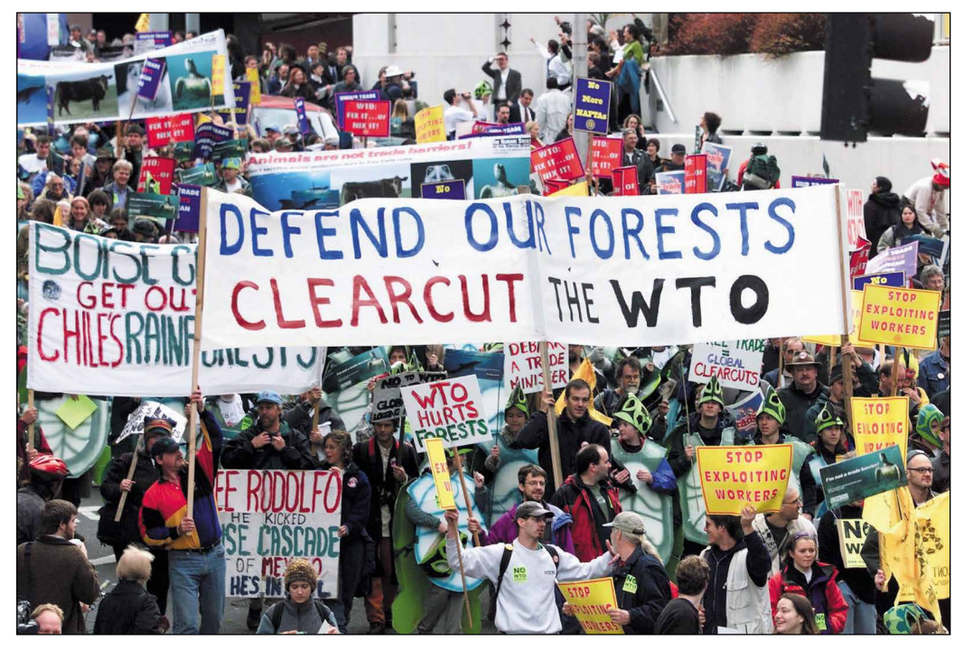
Protestors march in downtown Seattle on 29 November 1999, the day before the start of the Third WTO Ministerial Conference.