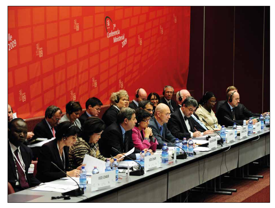
The Seventh WTO Ministerial Conference is held in Geneva, 30 November to 2 December 2009.