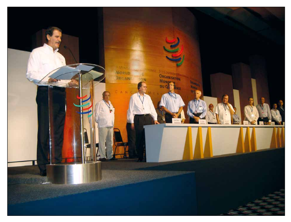
Mexican President Vicente Fox inaugurates the Fifth WTO Ministerial Conference, in Cancún, 10 September 2003.