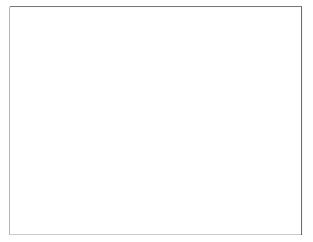
Minister for Youth, Employment Opportunities and Sports James Ah Koy led Fiji's delegation to the first WTO review of the country's trade regime.

On more specific matters, the representative noted that the application of specific rates of duties on some commodi-