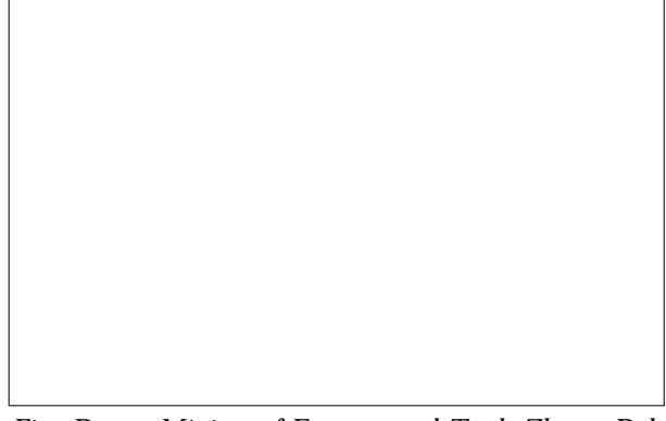
First Deputy Minister of Economy and Trade Zhanat Dzh. Ertlesova (centre) explained in detail Kazakhstan's economic and trade reforms.

Vice-Minister of External Economic Relations Georgy Gabuniya, headed the Russian delegation, reaffirmed Russia's intent to join the WTO and for Russia to achieve full integration into the world's trading system. He said also that Russia is keen to accelerate the accession process and that full-scale negotiations and intensified bilateral consultations could start before the end of the year. \Box