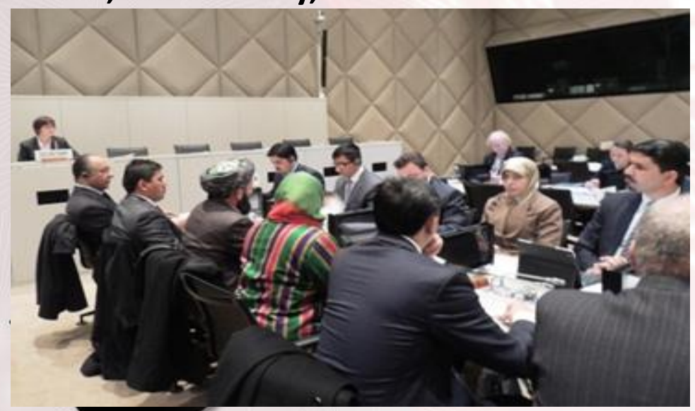
3<sup>rd</sup> P, 7<sup>th</sup> December, 2012