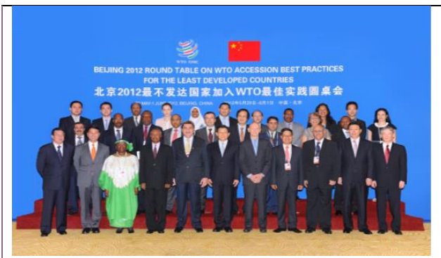
First China Round Table: "Best-Practices in the WTO Accession Process"