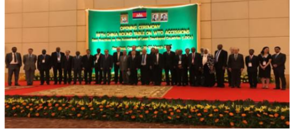
Fifth China Round Table: "Best Practices on the Accessions of Least Developed Countries LDCs"