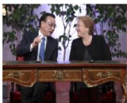
China, Chile sign currency swap pact