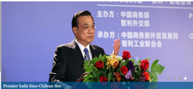
Premier hails Sino-Chilean ties