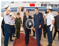
Recap: Premier's Latin America tour