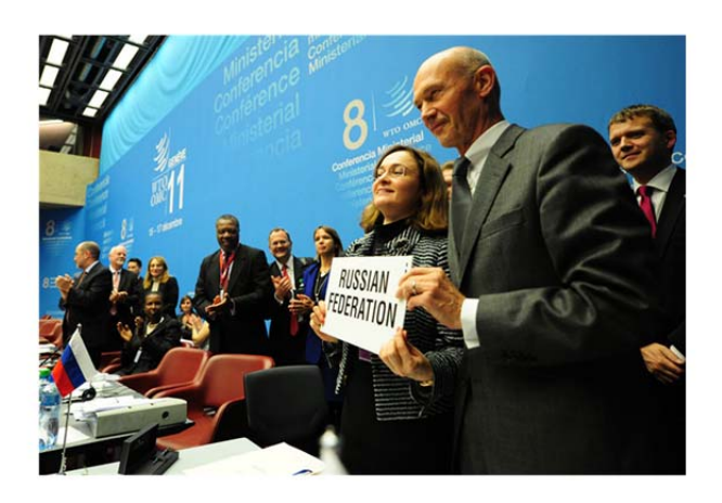
Eighth Ministerial Conference, 16th December 2011

December General Council, annual outreach with various WTO regional groups: the Arab Group; the African Group; GRULAC; and the LDCs' Consultative Group.