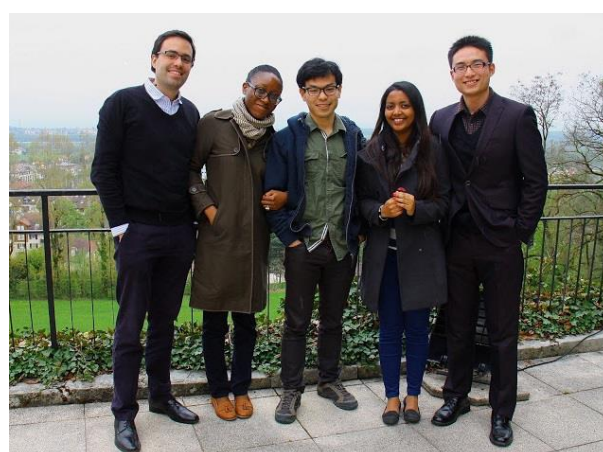
China's LDCs and Accessions Programme Interns, 29 April 2013

As part of the Accessions Internships Programme, interns from LDCs and developing countries were currently working in the Division.