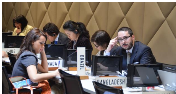
Informal Group on Accessions, Geneva, 30 May 2013

Seychelles : Seychelles had submitted a massive amount of technical inputs for its next cycle of meetings. Only updated Agriculture Supporting Tables (AGSTs) were outstanding. Victoria was working round the clock with Working Party Members. The Secretariat has prepared the Elements of the Draft Working Party Report. Draft specific commitment paragraphs have been prepared by Victoria and circulated for Members' review. A revised Legislative Action Plan and associated technical inputs have been circulated. Seychelles was committed to concluding as many Bilateral Market Access negotiations as possible by the next cycle of meetings, scheduled for 21 June. Its target was to work for the emergence of its Draft Accession Package as soon as possible.