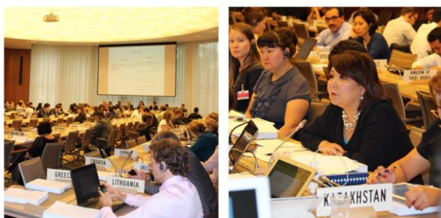
Accession of Kazakhstan - Cycle of WP Meetings - 21-23 July 2014

Although several issues remain to be resolved in this accession, there is a predictable process under way that is yielding concrete results. Improvements have been made possible by the active engagement of the Delegation of Kazakhstan, led by H.E. Minister Zhanar Aitzhanova, Minister for Economic Integration and Chief negotiator of Kazakhstan. The main issues being addressed include: (i) tariff adjustment and associated compensation; (ii) complications caused by the Eurasian Economic Union (EAEU) in on-going accession negotiations, and; (iii) SPS. Other issues include Agriculture along with questions in the Draft Working Party Report and the Draft Goods Schedule.