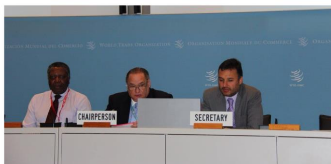
Briefing on Accessions for the Informal Group on Developing Countries (IGDCs) - 21 July 2014