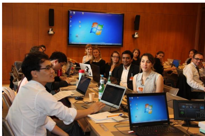
Presentation on WTO Accessions for students from the Washington College of Law, American University - 14 July 2014

The Accessions Division continued to provide accessions-specific technical assistance and capacity building in coordination with ITTC.