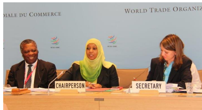
Accession of Seychelles - 6 th Working Party Meeting - 3 July 2014