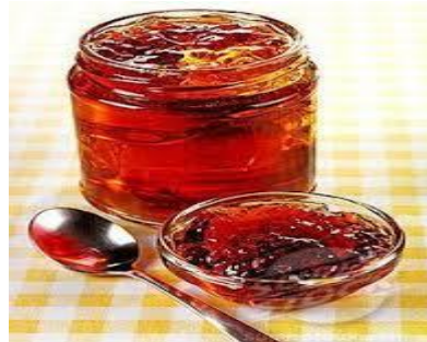
Jams and Jellies