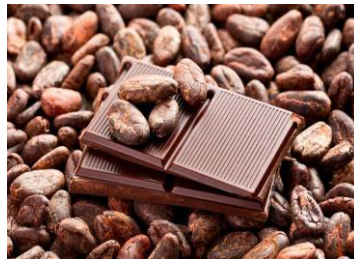
Cocoa & Chocolate