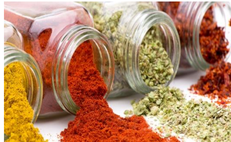
Seasonings / Spices