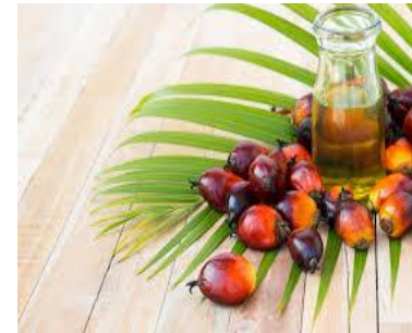
Black Castor Oil