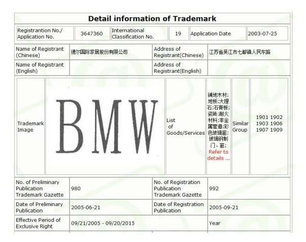
Figure 4.1: The trademark 'BMW' filed by DER for registration in China

To achieve the basic functions of the institution of well-known trademark (i.e. to prohibit others from registering and using the trademark which is identical with or similar to the well-known trademark)<sup>26</sup>, the Third Amendment of the Trademark Law makes the following revisions and improvements: