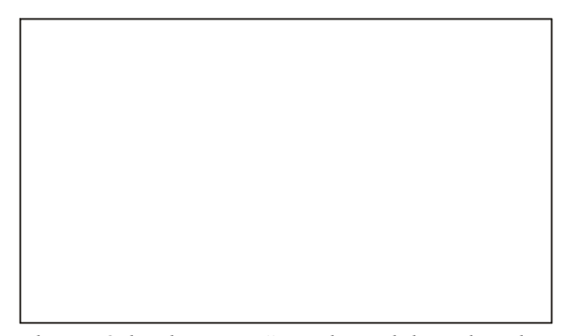
The WTO headquarters: "For the multilateral trading system, the stakes this year could not be higher."

For the multilateral trading system, the stakes this year could not be higher. In November, Qatar will host the next WTO Ministerial Conference. Our aim is to launch a new round of multilateral trade negotiations. It is a big chal-