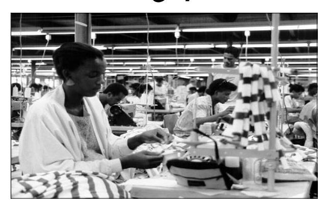
Developing countries are urging more commercially meaningful implementation of the WTO Textiles Agreement.

The United States maintained that its integration programme was in full compliance with the ATC, which left the choice of products to be integrated to the importing