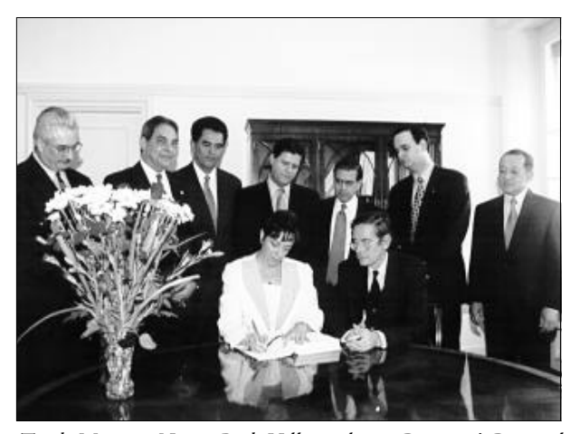
Trade Minister Nitzia R. de Villarreal signs Panama's Protocol of Accession to the WTO on 2 October, witnessed by Panamanian and WTO officials.