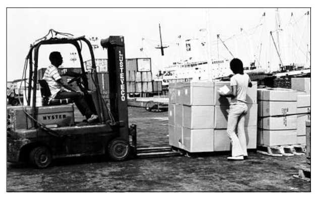
The United States and the EC are calling for further market opening in the developing countries and stricter enforcement of anti-circumvention rules.

be improved through greater transparency and ensuring impartiality in decision-making; and