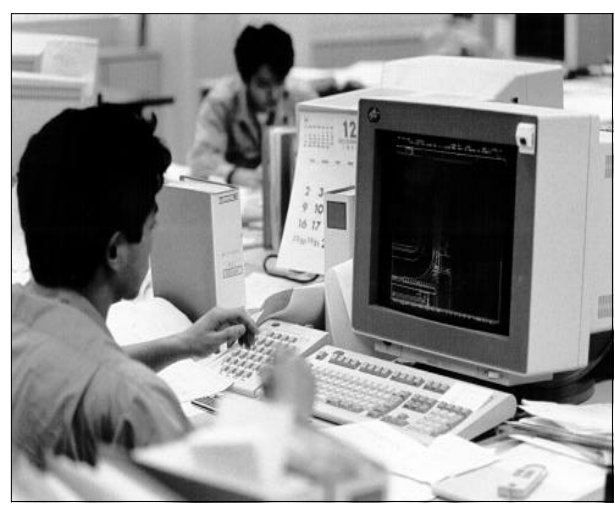
A Singapore agreement to eliminate tariffs on computer products would unlock a key tool of future growth.

of future growth in industrial and developing countries alike.