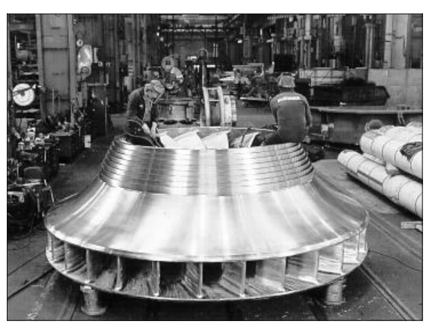
Norway's rich hydroelectric power resource is considered to be a major comparative advantage.

The representative said that technical regulations and SPS measures were consistent with WTO obligations. He provided further details on assistance to developing countries