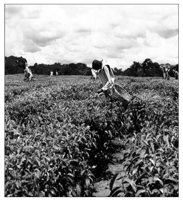
We need a message of unity and determination among industrial and developing countries to help the least-developed countries.